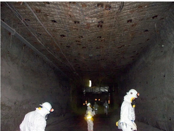
WIPP personnel conduct visual inspections of the underground, as part of ensuring a safe working environment.

On May 28, WIPP workers entered the underground facility to adjust the ventilation system. While underground, they adjusted a regulator on a bulkhead door and closed and taped doors at another underground location to allow more air flow through Panel 7 and better ventilation control in preparation for the planned filter change.