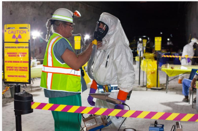
Respiratory requirements have been reduced thanks to radiological contamination mitigation progress in the WIPP underground.

In May of 2015, initial panel closures, using chain link, brattice cloth, run of mine salt material and steel bulkheads, were installed on Panel 6 and Panel 7 in Room 7, the location of the 2014 radiological release. In addition, continuous air monitors were installed outside the bulkheads on the intake and exhaust sides. These closures physically isolated the waste stream that caused the radiological release, providing additional protection for the underground workers and fulfilling one of the requirements in a New Mexico Environment Department administrative compliance order.