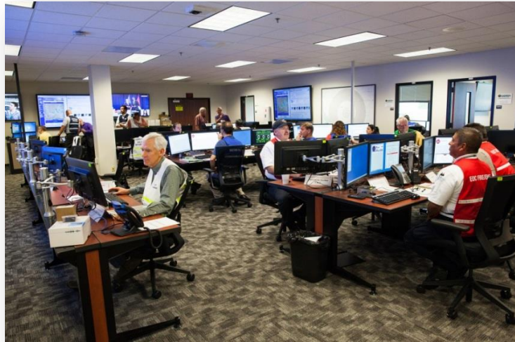
The new, state of the art, offsite Emergency Operations Center became operational in late 2015.

Improvements were also made to the WIPP's emergency response capabilities. In 2015, construction was completed on a 4,000 square foot, state of the art Emergency Operations Center (EOC). The Skeen-Whitlock Building is located on the south side of Carlsbad away from the WIPP site and houses the Carlsbad Field Office. It was remodeled to include the new EOC.