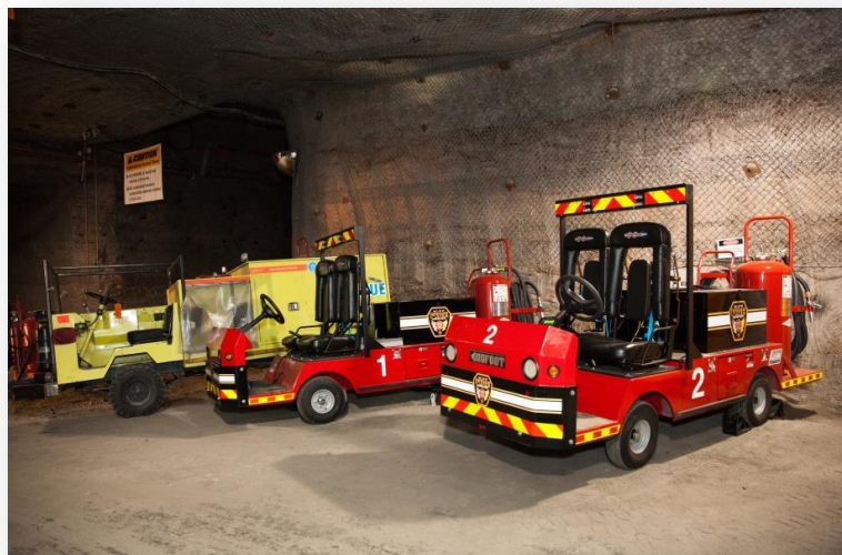
New underground fire-fighting equipment has been purchased over the past two years.