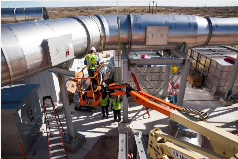
Installation of ducting for the Interim Ventilation System is nearing completion.

Much like the existing underground ventilation system (UVS), the IVS unit consists of fans that will draw air out of the underground and pull it through High Efficiency Particulate Air (HEPA) filter units before it is released to the environment. The IVS will be connected to the existing UVS ductwork and the two units will work in tandem to increase airflow in the underground from the current 60,000 cubic feet per minute (CFM) up to 114,000 CFM. Since the 2014 events, all air exiting the WIPP underground passes through HEPA filters prior to being released to the outside. The increase in airflow is necessary to meet permit requirements for resumption of waste placement operations and will increase the amount of work that can be performed underground.