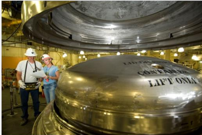
Waste Handling personnel will verify procedures and processes during Integrated Cold-Run activities.

In addition to waste handling and emplacement operations, cold operations will also test the Safety Management Program improvements for fire protection, radiological controls and emergency management response. Use of the underground emergency notification system and localized fire suppression systems will also be included in the exercises.