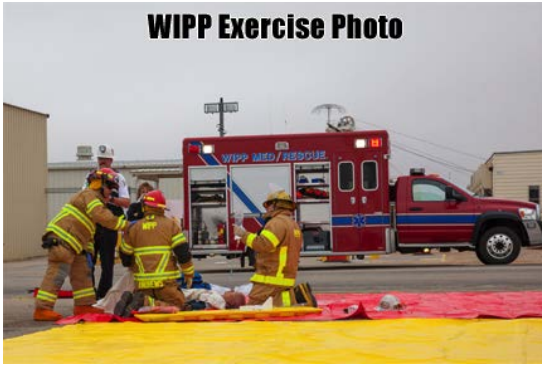
WIPP Emergency Response personnel tend to a simulated injured patient during the annual exercise.