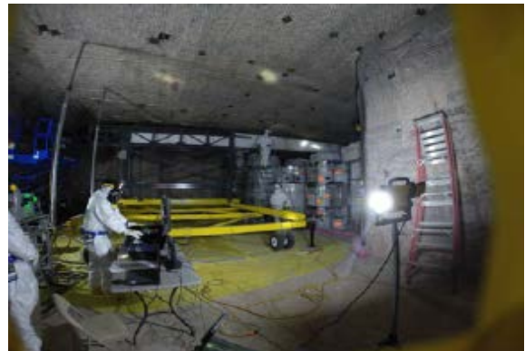
Project Reach team members work to obtain video of emplaced waste located in Panel 7, Room 7 where the radiological event occurred.

AIB members are currently reviewing the video data while WIPP employees dismantle the Project Reach device. Click here to view a short video clip of Project Reach.