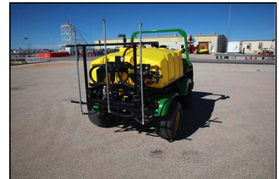
The spraying machine has three articulating spray arms that allow it to apply the water mist at various angles and heights.

The City of Carlsbad and DOE will co-host its Town Hall meeting featuring updates on WIPP recovery activities. The meeting is scheduled for Thursday, April 2 at 5:30 p.m. Location: Carlsbad City Council Chambers, 101 N. Halagueno Street. Live streaming of the meeting can be seen at http://new.livestream.com/rrv/ .