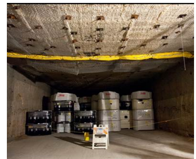
Yellow brattice cloth is suspended from the ceiling in this disposal room. It is rolled down to prevent air flow to the room. Brattice cloth also will serve as a barrier to decontaminate floors.