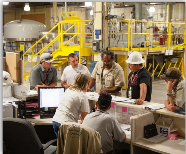
Waste Handling and Radiological Control personnel discuss a waste handling procedure during a recent Cold Operations training evolution.

The second hybrid bolter and an additional mining crew are expected to address outstanding ground control issues and the IVS is now expected to be operational in August. Subcontractors are on site performing tests on existing fire protection systems and installing automatic fire suppression systems on vehicles used in the underground.