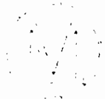
Table J-A: Results from UNCERT's VARIO Module

Not Attached. Available in SWCF. Kurt Larsson 7/12/96.