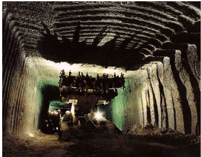
Figure 4. Marietta Drum Miner at WIPP

DOE considered potash within the McNutt Potash horizon of the Salado formation when evaluating the effects of mining on the PA. Within the Carlsbad Known Potash Leasing Area, exploration holes have been drilled to evaluate the grade of the various ore zones. Although some of the ore zones have been labeled as high grade, the ore still may not be considered reserves if properties such as high clay content make processing uneconomical. None of the economically minable reserves identified by the NMBMMR (1995) lie directly above the waste panels. NMBMMR (1995) identified additional minable resources, including caliche, salt, and gypsum, but DOE concluded that these resources are not economically attractive, given the low sale price of the reserves and more cheaply mined alternatives. The Agency agreed with this conclusion.