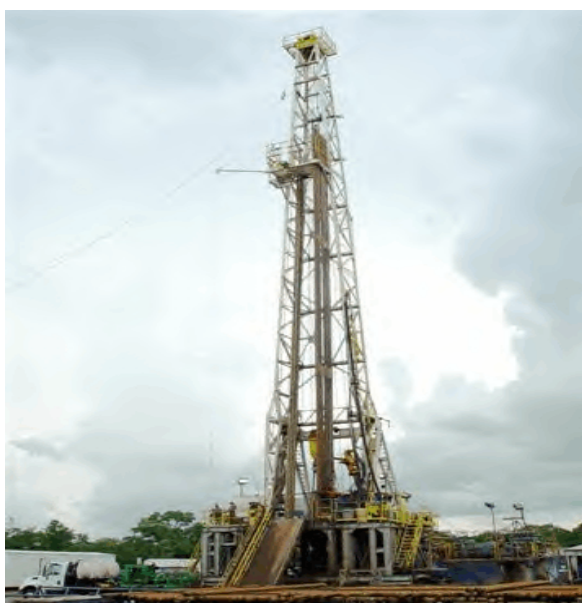
1. Drilling Rig, New Mexico.

DOE indicated that deep wells in the area near the WIPP site range from 5,000 to 15,400 feet deep, depending on the hydrocarbon-producing formation targeted. Standard completion technology included hydraulic fracture treatment of perforated long string casing using a variety of gelled fluids to emplace sand proppant into the fractures. DOE indicated that acid treatments and acid fracture treatments are frequently used and assumed that all oil- and gas-related boreholes in the area will be plugged according to current applicable regulations. CCA Appendix DEL.6.2.3 (p. DEL-71) discussed post-1988 boreholes declared shut-in or temporarily abandoned that have been plugged. This is consistent with data indicating that 100 percent of the wells drilled since 1988 were plugged or are in the process of being plugged to meet standards (Appendix MASS). The Agency examined the air drilling issue from several perspectives and documented its findings in the CCA TSD EPA’s Analysis of Air Drilling at WIPP (EPA 1998b) and in CCA Response to Comments, Section 8 (Docket A-93-02, V-C-1). The results of EPA’s analysis showed that air drilling is not current practice in the Delaware Basin through the salt section.