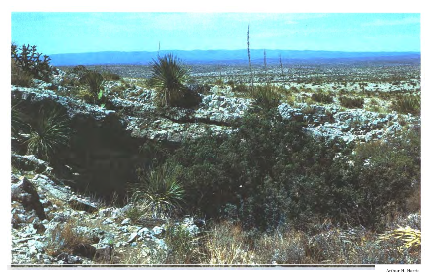
Figure 2. The entrance to Dry Cave, with the Guadalupe Mountains in the background.

cant cool-season precipitation from the seasonal summer rains.